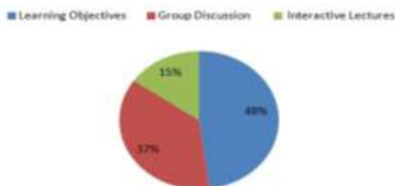
Fig. 1: Teaching Methods

about teaching aids, 37% expressed their view that PPT was more useful over conventional chalk and board teaching (30%). Out of 98 1 st MBBS students, 33% were of the opinion that Demonstration was quite helpful in understanding the topic (Fig. 2). About various teaching learning methodologies, 52% opined that quiz programmes were the most enjoyable way of learning than tutorials (36%). Student's seminars came out to be the least preferred method of learning (12%) as shown in Fig. 3.