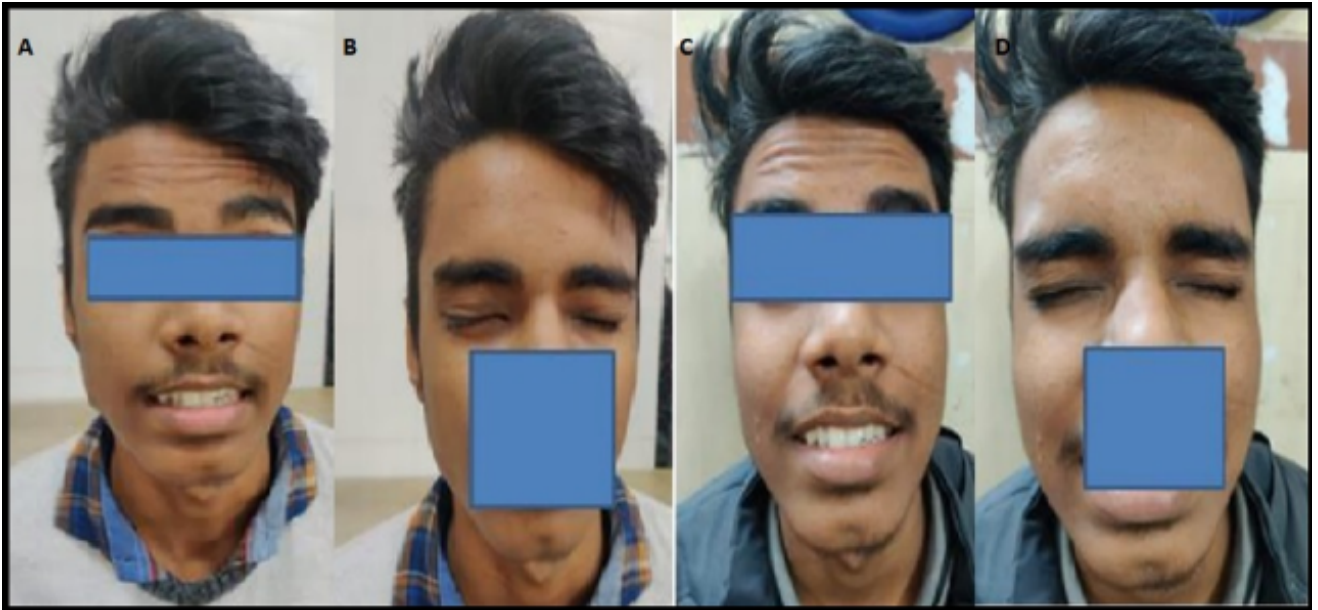
Figure 1: Initial presentation showing; (A): Reduced wrinkles on right forehead with right shallow nasolabial fold; (B): partial closure of right eye; with follow-up showing normal forehead wrinkling and nasolabial fold (C), and normal closure of eyes (D).

C-reactive protein was elevated (18 milligram/deciliter). His serological tests for malarial parasite, HIV, Hepatitis B, Hepatitis C were negative. Dengue serology showed positive NS1 antigen at day 3 and positive IgM at day 7 of fever-onset. With non-contrast computed tomography of head was normal. He was treated with short-course oral prednisolone therapy (omnacortil 40 mg/day once daily for 5 days with tapering dosage for next 5 days) and facial physiotherapy.