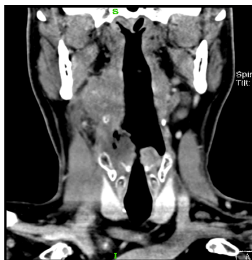
Fig. 3: CT image