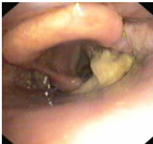
Fig. 1: Flexible endoscopy image

Patient was treated with intravenous antibiotics and blood sugar levels controlled by taking physician opinion. Once the patient sugar levels are controlled patient was taken for suspension micro laryngoscopy under GA. Under the microscope surgical debridement of extensive slough over right supraglottic region and right pyriform fossa was done. No evidence of any dirt or foreign body was found at the debrided area on right supraglottic region and right pyriform fossa. Patient was discharged with complete remission of the neck swelling with minimal residual hoarseness which resolved over the next 6 months [Figure 4].