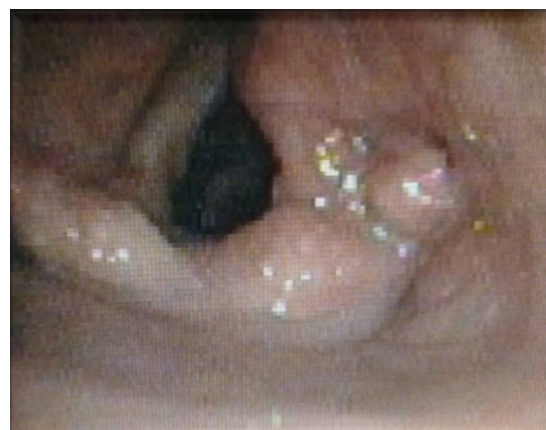
Fig. 4: Post treatment image